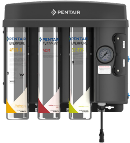
EZ-RO 375/30ATM wall mount