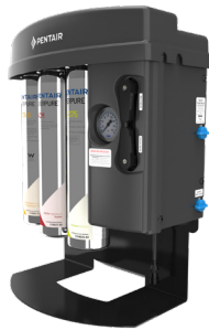
EZ-RO 375/30ATM with optional floor stand bracket