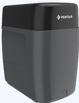
30-gallon atmospheric tank